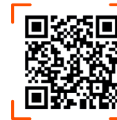
VIDEO DEMO Sprayer KRD-AP37-1B